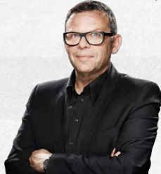
Peter Schreyer Kia Chief Design Officer & President

“Through design, the Kia brand will become etched in customers' hearts.”