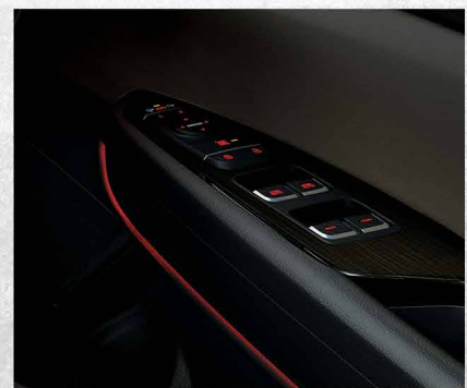
LED Ambient Lighting (GT only) Set the interior to suit your mood with 6 different colours.