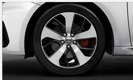
GT 18" Wheel