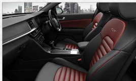
Red and Black Leather (GT)