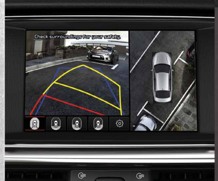
Around View Monitor (AVM) Park and manoeuvre safely with 360-degree visibility.