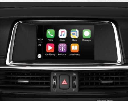
7-inch Touchscreen with Android Auto™/Apple Carplay™ Intuitive touchscreen with Android Auto™ and Apple Carplay™ offer smooth, seamless connection.

Red on black leather seats bring out the sporty flair in the interior.