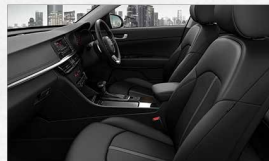
Black Fabric (EX)