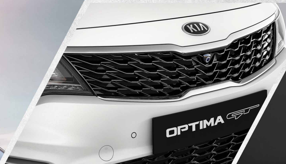
New Tiger Nose Grill Design The thrill begins before you drive with a new, aggressive grill design.

Now with new features to keep you ahead of the pack.