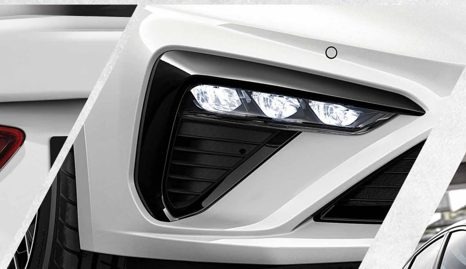
New LED Fog Lamp Design A distinctive foglight design offers a clearer view ahead, even in adverse weather conditions.