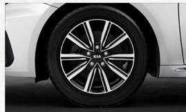
EX 17" Wheel

“Through design, the Kia brand will become etched in customers' hearts.”