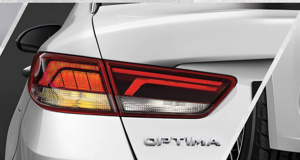
New Rear Combination LED Lamps Bring style to light with the new LED light pattern in the rear lamps.