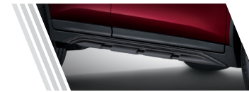
New Gloss Black TOMEI Side Under Spoiler