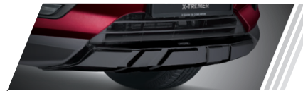
New Gloss Black TOMEI Front Aero Bumper