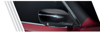
New Gloss Black Side Door Mirrors